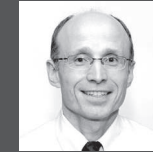
Pr Klaus Busam New York, USA